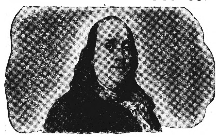
BENJAMIN FRANKLIN (A Rosicrucian)

WHY was this man great? How does anyone—man or woman—achieve greatness? Is it not by mastery of the powers within ourselves?